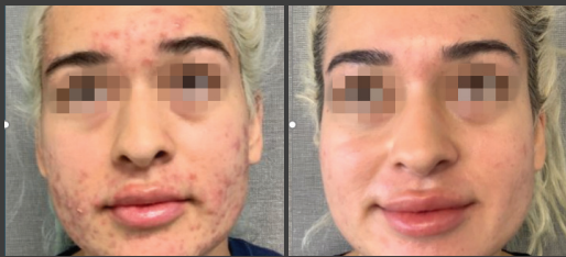
Before and after 2 treatments

The Ultra laser works by targeting unwanted pigment like sunspots, freckles or age spots in the superficial layers of your skin to reveal a brighter more youthful complexion.