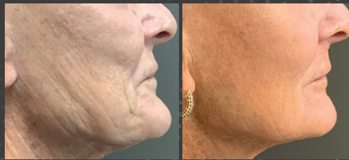
Before and after 3 Treatments

Potenza® RF microneedling uses ultrafine needles and radiofrequency energy to penetrate the deeper layers of the skin and trigger the body's natural healing processes to tighten skin*, improve blemishes and stimulate new collagen and elastin.